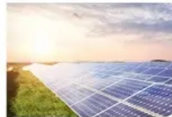
Energy Storage System